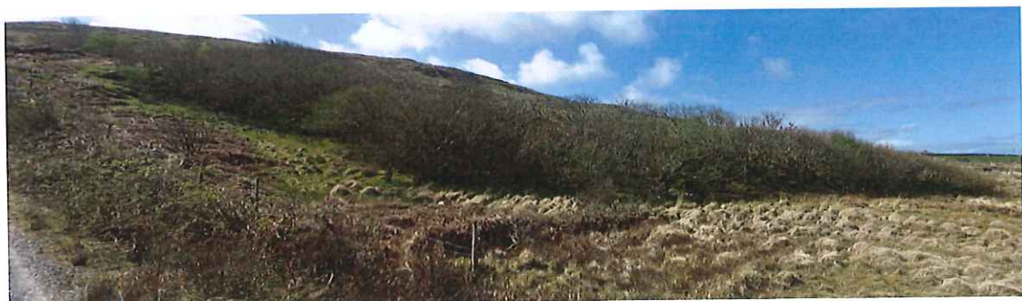
The small forest / trees beside Emma and Susanna's house